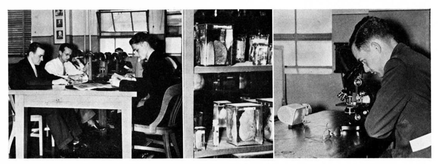
Studying in the library, examining pathological specimens in the Museum, or studying bacteria through a microscope, medical students are reputedly the hardest workers of any collegians.