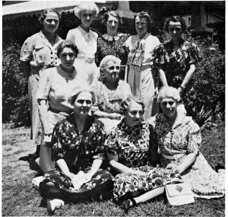
Classmates of '06 have reunion (Names in adjoining article)

Most of those in the group were charter members of the University chapter of Kappa Alpha Theta.