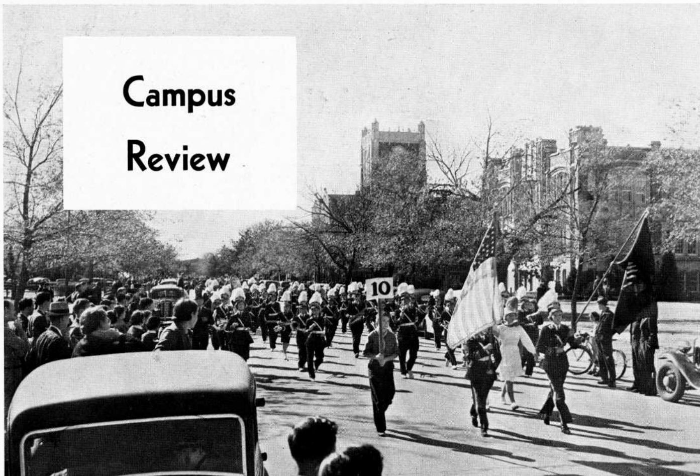
High School Band Day is becoming one of the big annual events on O. U. campus. Above, part of contest parade this year.