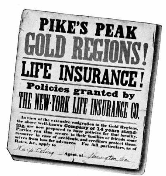
Facsimile of New York Life poster issued in 1859.