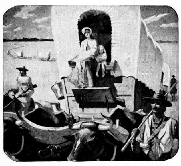
FACING THE HARDSHIPS of the Overland Trail were men from every walk of life. Many of these hardy pioneers, realizing the dangers ahead, insured with the New York Life. Thus the Company spread the benefits of its protection westward, growing with the nation.