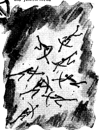
BELOW: THE OLDEST PICTURE OF MAN: The creature, Van Loon points out, is engaged in his customary pastime of killing his fellowmen.