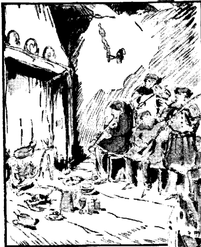
ABOVE: The beginning of our modern orchestra. Jongleurs improvising a little concert while waiting for their dinner to get ready in the kitchen.

The illustrations shown below are reproductions of a few of the many paintings and drawings which Hendrik Van Loon made for The Arts. A book of over 800 pages, with over 100 full-page illustrations, 48 in full color, 32 in wash—and in addition innumerable illustrative line drawings.