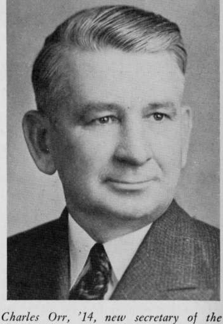
Interstate Oil Compact Commission

Illinois held a fish fry Saturday night, August 26, at Effingham.