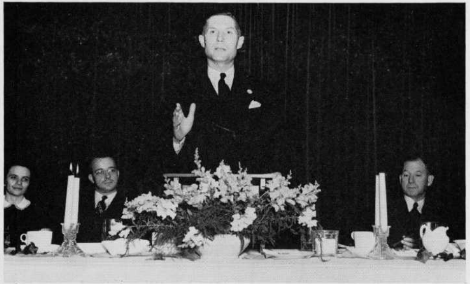
Rep. Mike Monroney's address on federal government was a highlight of the speech institute held on the University campus

Mike Monroney, congressman from the fifth Oklahoma district, spoke to the group at its opening meeting. His subject was government, a subject often dull. The congressman, however, colorfully described present relations of world powers, joked about their government and ours, brought out the serious side, too, and held the interest of his audience throughout.