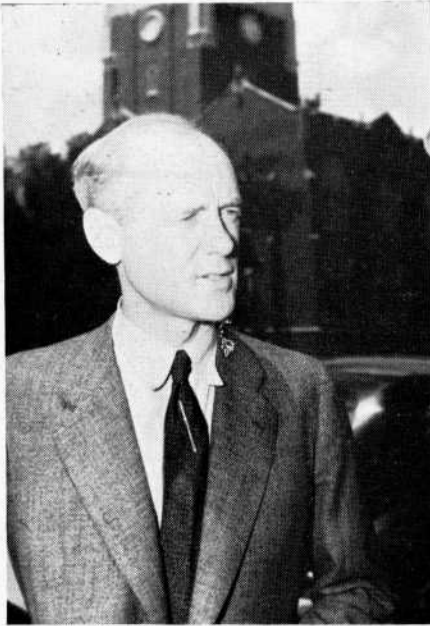
Clarence Streit, author of "Union Now," headlines International Relations Institute Program