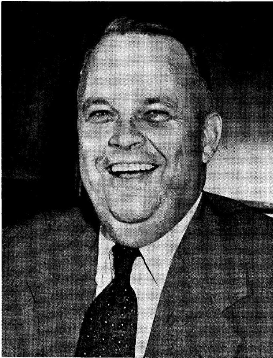
ROBERT S. KERR, '16

Genial Bob Kerr, Democratic nominee for governor of Oklahoma, exhibits the much-photographed broad grin which was one of his campaign assets. Refreshed by a couple of fishing trips in August, Mr. Kerr said he would await the general election in November before talking much about his plans.