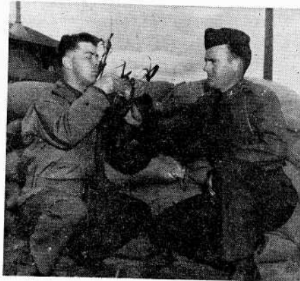
SOONER TEACHES SOONER