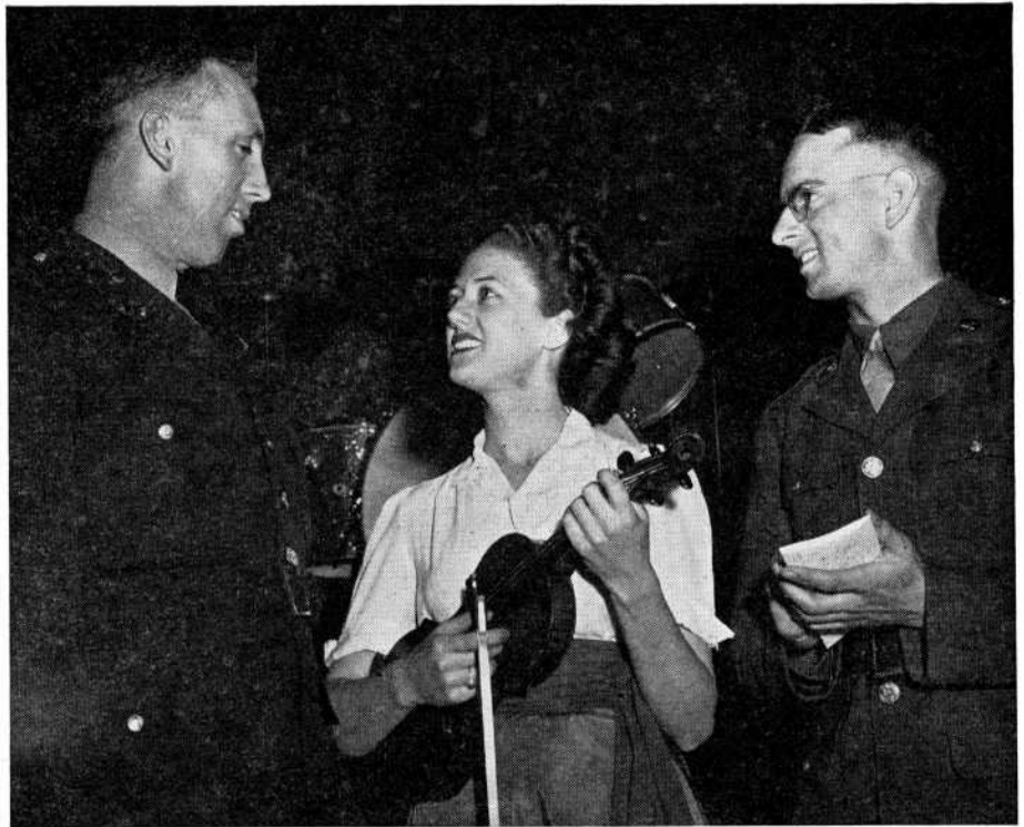
PUBLIC RELATIONS, CAMP ROBERTS