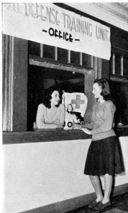
STUDENT WORKERS REGISTER At headquarters in Union, volunteers are enrolled for war aid projects

Although there is a standard charge of 50 cents for preparing a transcript of credits, the University waives the fee when the transcript is sought by a former student going into military service or defense work.