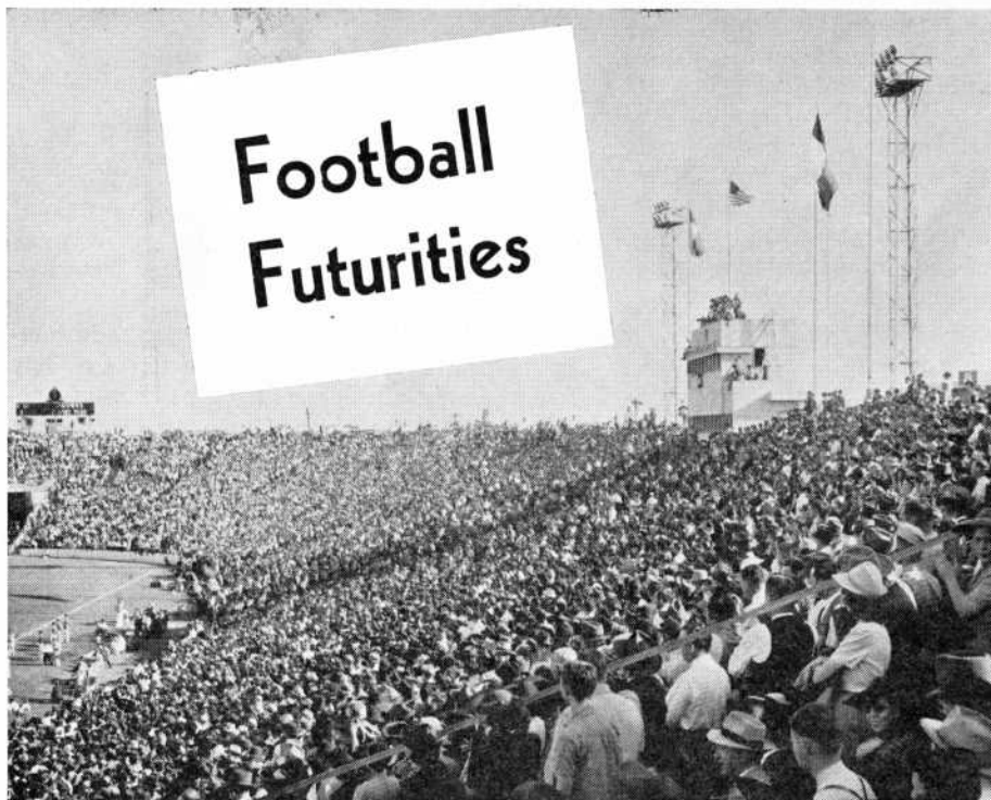
O.U.'s BEST-PAYING GAME

View of the huge crowd that saw the Sooner-Texas game in the Cotton Bowl