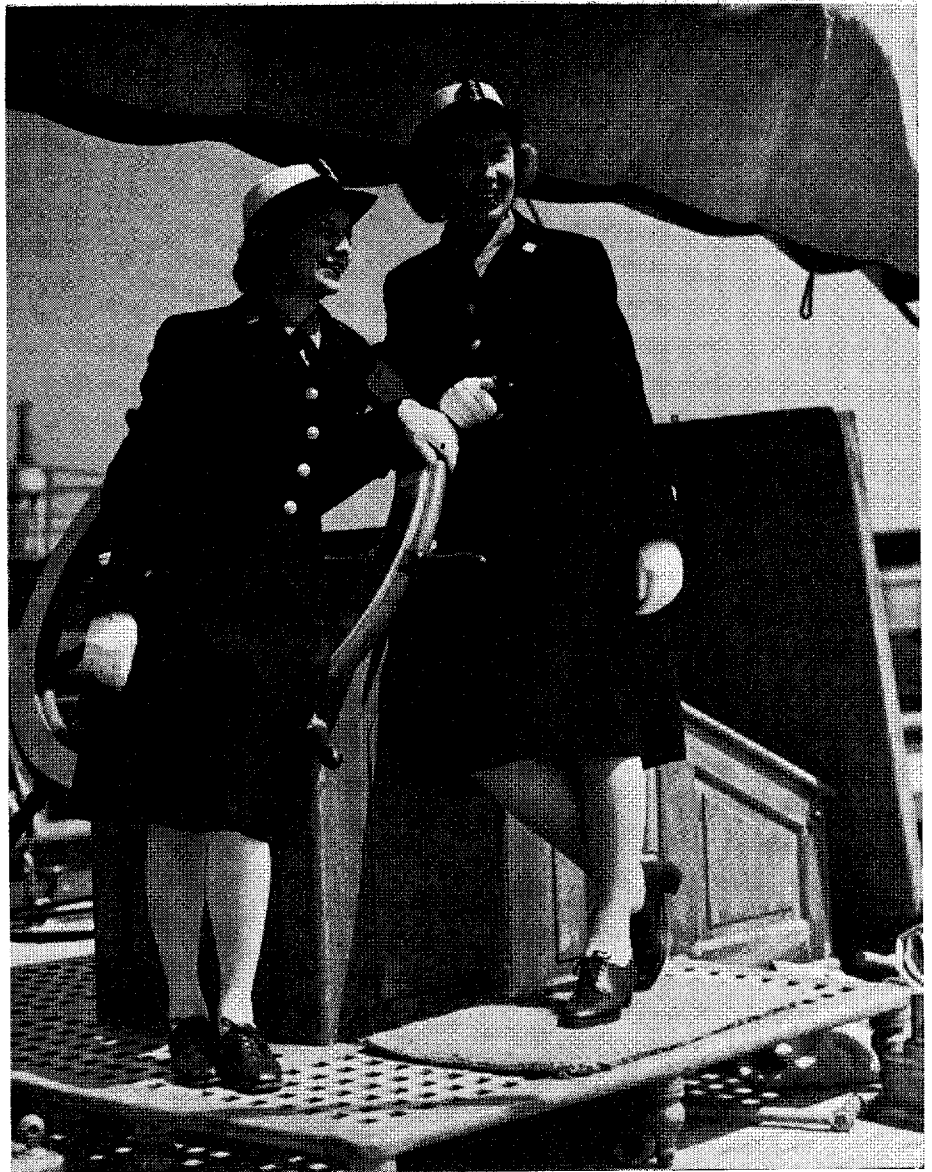
SOONER SPARS GET TANG OF SALT LIFE