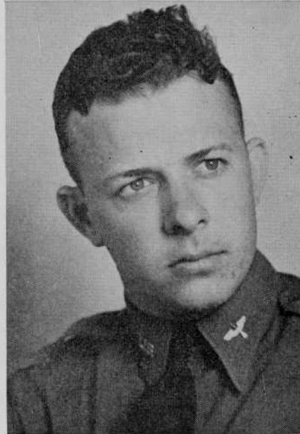
NO DULL MOMENTS

In presenting the medal at Pearl Harbor, Admiral Chester Nimitz said, "You