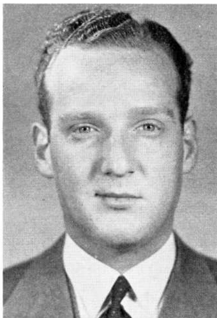
HEADS '44 CLASS