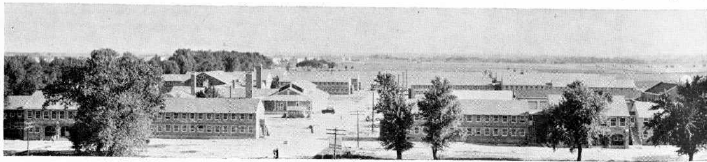
WAR DORMITORIES VIEWED FROM ATOP OWEN STADIUM