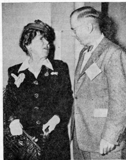
GOOD TIME WAS HAD