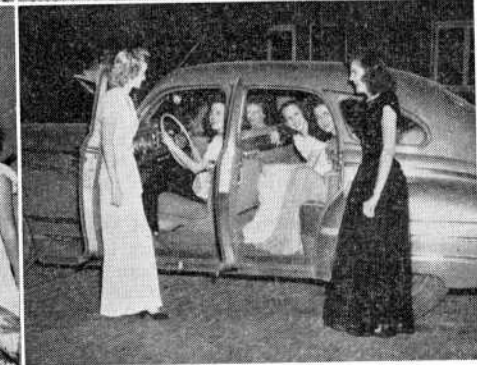
Typical of the hurry-about-push-and-tussle that takes place each fall season are the sorority rush activities pictured above. Chapters represented are Chi Omega (upper left), Alpha Chi Omega (lower left) and Pi Beta Phi (upper and lower right).