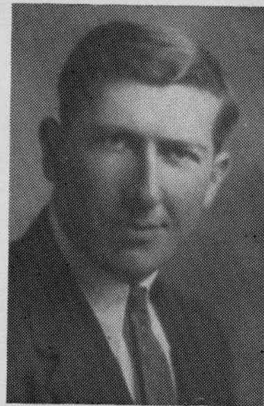
The Late LT. CLYDE E. FLEMING

The citation read "for meritorious achievement while participating in sustained operational flight missions in the Southwest Pacific area. The courage and devotion to duty displayed during these flights are worthy of commendation."