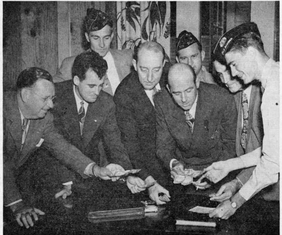
The old veteran O.U. alums "drop in" to be of every possible assistance to the World War II American Legion Post No. 303 sponsored by the thousands of young vets on the campus of the University of Oklahoma. In the above picture, a mad scramble was on to purchase ticket number one on a certain car on a certain campus that was "given" away in the interest of funds for service work by the Thomas C. Reynolds American Legion Post No. 303 at O.U.