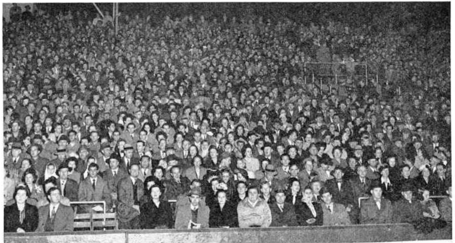
More than 200 University of Oklahoma alumni are shown here in their special section located behind the Sooner bench at the O.U. Detroit football game in Detroit September 26. Hundreds of alums gathered from all sections of the country for the contest.