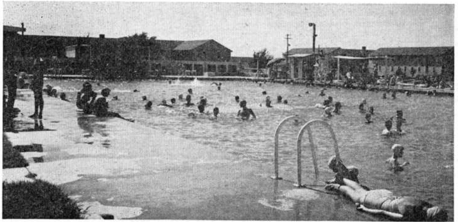
This scene was once the site of an 80-acre cornfield. But that was before the Navy took over during the war and built this swimming pool as one of the improvements of the South Base—now O.U.'s South Campus. Many relaxation hours were spent at the pool by students in school during the hot summer months. A modern filtration plant keeps the water clean and healthful.