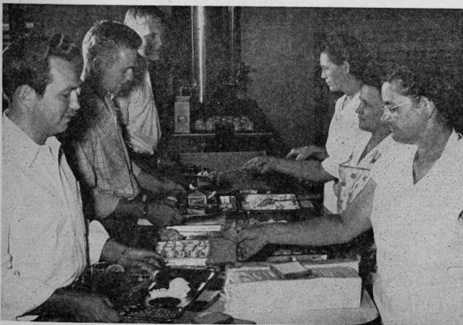
Here's where a part of the $220,000 worth of food was dished out last school year by University dining halls. This amount excludes the thousands of dollars worth of food served in the Oklahoma Memorial Union cafeterias. The above picture was made at a South Campus dining hall during enrollment week.

The military department is fully equipped as an armored cavalry platoon. Its armored equipment includes light tanks, self-propelled assault gun, armored car, half-track personnel carrier, trucks and jeeps. Most of these vehicles have two-way radios. The