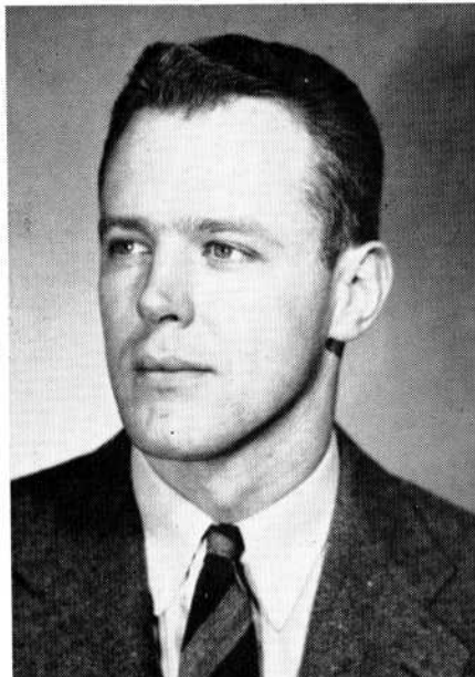
BUD WILKINSON All-Star Coach

The non-football phase of his navy hitch involved service as a hangar deck officer on the air-