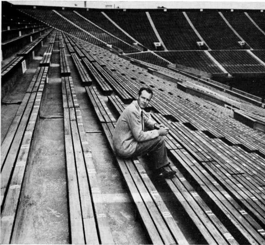
The wistful looking young man is none other than Bud Wilkinson, headman for Sooner athletics and football coach. The empty stands will have a different look when Wilkinson fields his charges this fall.

Massachusetts; Naval Training Base, Sampson, New York; Quartermaster Training School, Gulfport, Mississippi; Naval Operations Base, Norfolk, Virginia and aboard the USS Gosselin in the Atlantic, Pacific and Asiatic theaters.