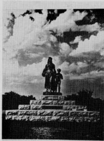
The Pioneer Woman, Ponca City—Bryson Baker, sculptor