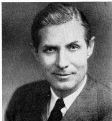
MIKE MONRONEY ... How Broad the Horizon?

As a freshman senator from Oklahoma (Bob Kerr, '16, will be senior senator), Mike will be expected to take a back seat to the senators with seniority. Yet no one believes it will be long before he gets out of the sinner's pew.