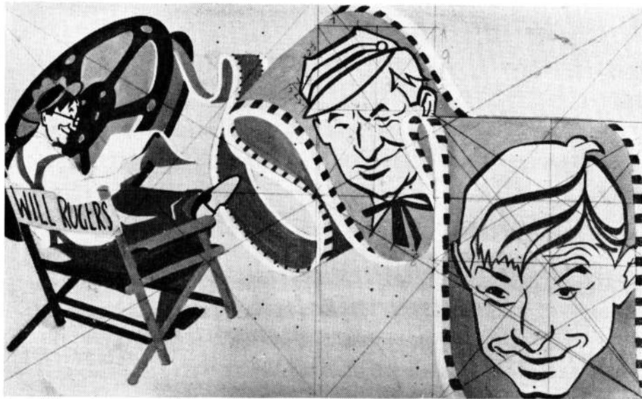
Rogers is shown here in a star's chair on a Hollywood movie lot. Movies brought him to all the people in the world, and he was the number one money-maker for Fox Studios.

and Kemper Military Academy. As a boy Rogers disliked school so intensely that he frequently ran away. So it is significant that his name is linked with one of the largest scholarship programs at the University. However, the nature of the Will Rogers Scholarship Fund is very much in line with his philosophy.