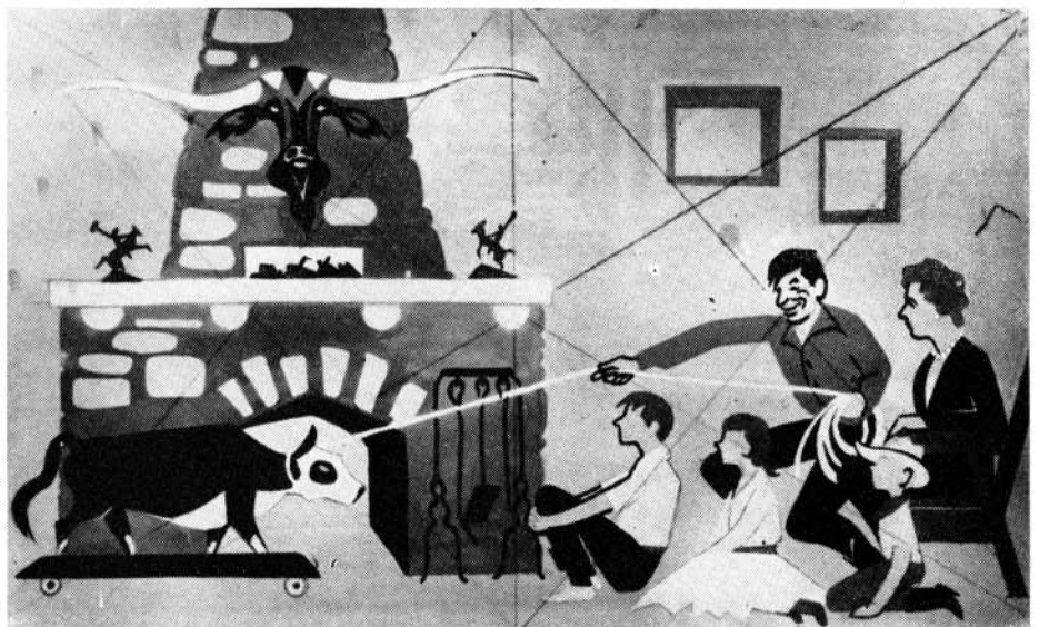
The fireplace of the Rogers home in Santa Monica emphasizes Will's home life. The stuffed calf was a much prized possession on which Rogers kept in roping practice.

And the handicapped have gone on to become active citizens. One youth, crippled since birth, received his O.U. law degree, thanks to a scholarship. Another is an