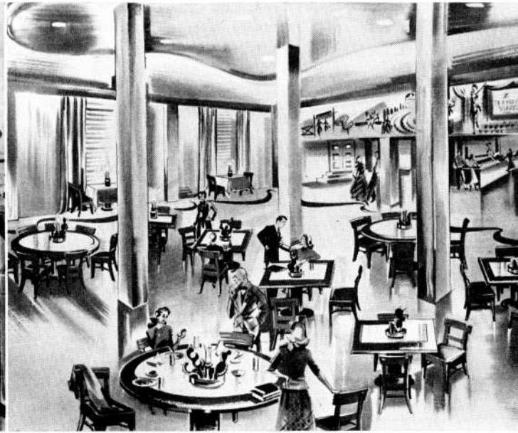
These watercolor sketches show the interiors of the fountain room and the cafeteria in the new north wing of the Union. Located next to the cafeteria, the fountain room (left) opens onto an outdoor dance terrace. The cafeteria is twice the size of the old one.