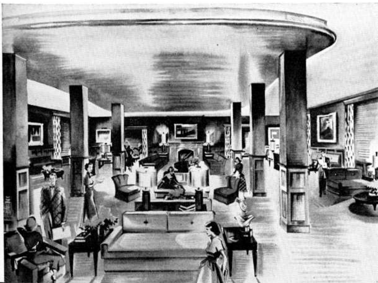
The student lounge (left) and the Oriental dining room (right) show how Designer Harrell has used the international modern theme in Union decorations. Planned for comfort and utility, these two rooms are distinctive, yet blend into the oneness of the Union.

More striking than the size of the Union is its decorations. The planners kept an eye on comfort, utility and beauty when