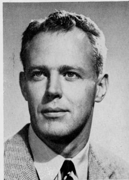
BUD WILKINSON "... A Game of Spirit"