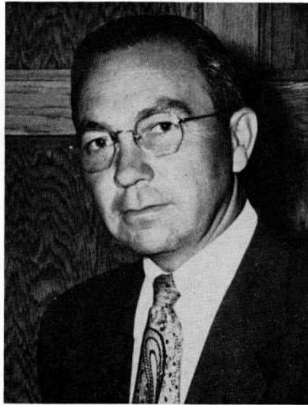
JUDGE ROYCE SAVAGE