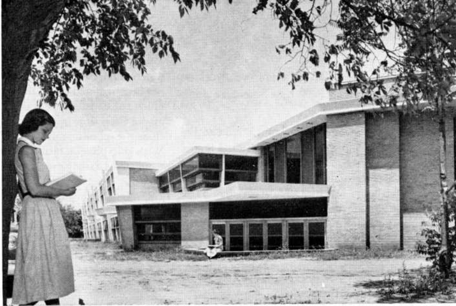
NEWLY COMPLETED HOME of the School of Home Economics provides an interesting comparison with the building that first housed the University of Oklahoma. As temporary quarters, the second floor of the building at left served as the first classroom. Much has been accomplished by the University of Oklahoma in 60 years.