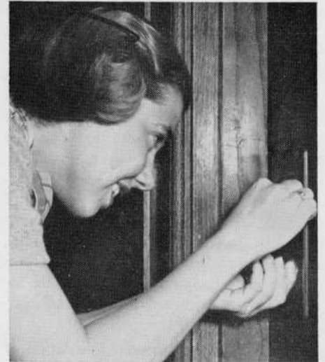
"KEYS TO THE KINGDOM." A coed's best friend is her hair pin when procuring prof's test.