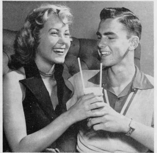
"COME FILL THE CUP." This carefree couple are products of the philosophy of eat, drink and be merry before the test.