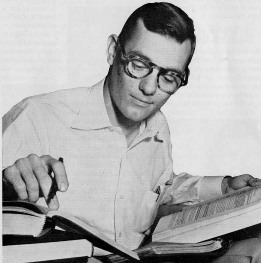
"OF HUMAN BONDAGE." There is always the student who ruins everybody's good time by resorting to his studies. Such students make classroom survival a nervous series of rationalized risks for . . . "The Informer." These comrades rely upon concealment of communications and the good neighborhood policy to aid them in their search for educational betterment.