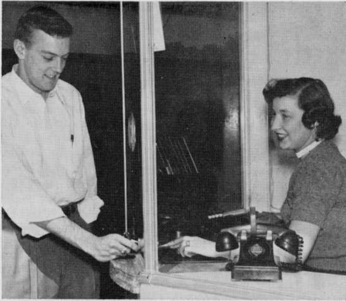
"TROUBLE ALONG THE WAY." Don't want to rush into those tests and get lathered into a frenzy where you can't think. Relaxation is the ticket.