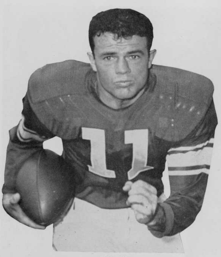
JACK GING ". . . They Never Want Me Till They See Me Play"