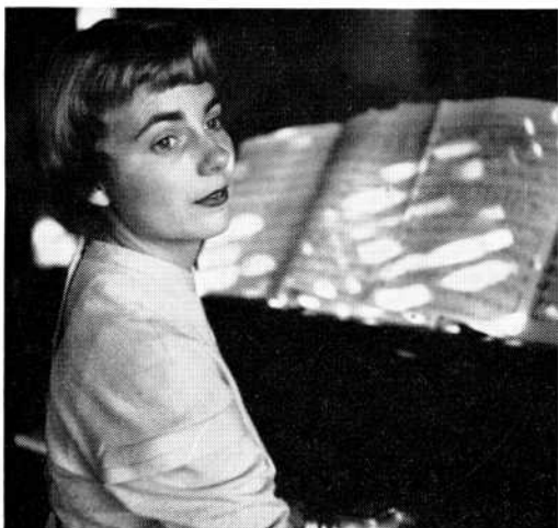
BEFORE DINNER, music; after date (right) and long day, relaxation. Saturday was finished. After Sunday lunch, it would be time to return to the campus.