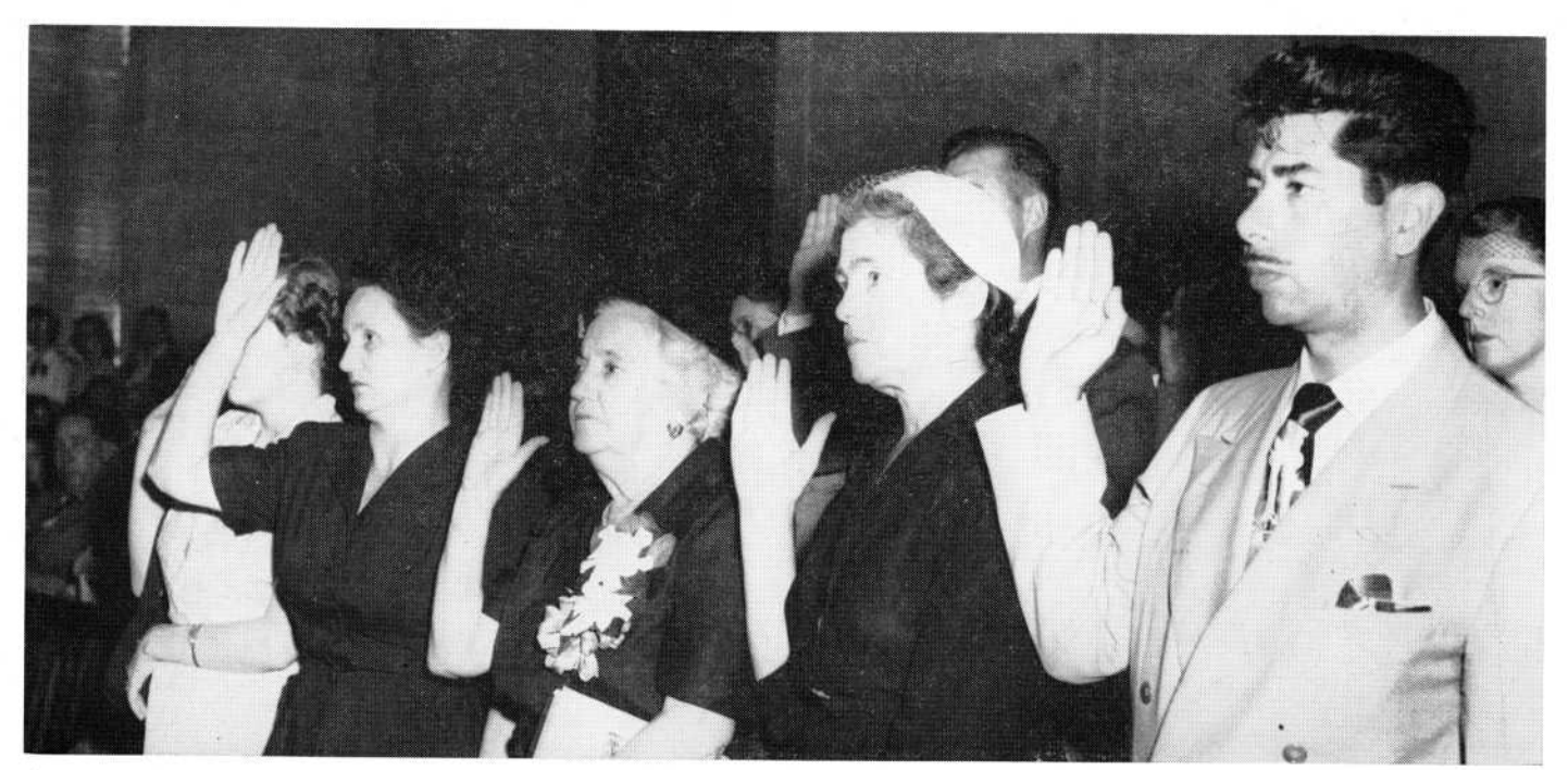
APPLICANTS for U.S. citizenship take oath of allegiance in Tulsa Federal court . . . "We do not promise . . . peace, but we do promise . . . liberty."