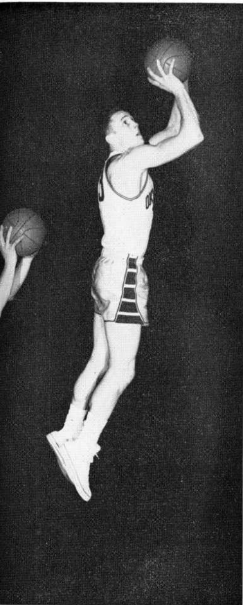
point-per-game scoring clip.