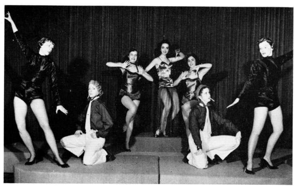
PI BETA PHI SORORITY MEMBERS in their Sooner Scandals "Candy Bar" skit. The girls carried out the theme of popular nickel candies. A highlight of the annual show, the entertainers (from ends to center in pairs) brought to life licorice, Hershey's, Powerhouse and Red-Hots.