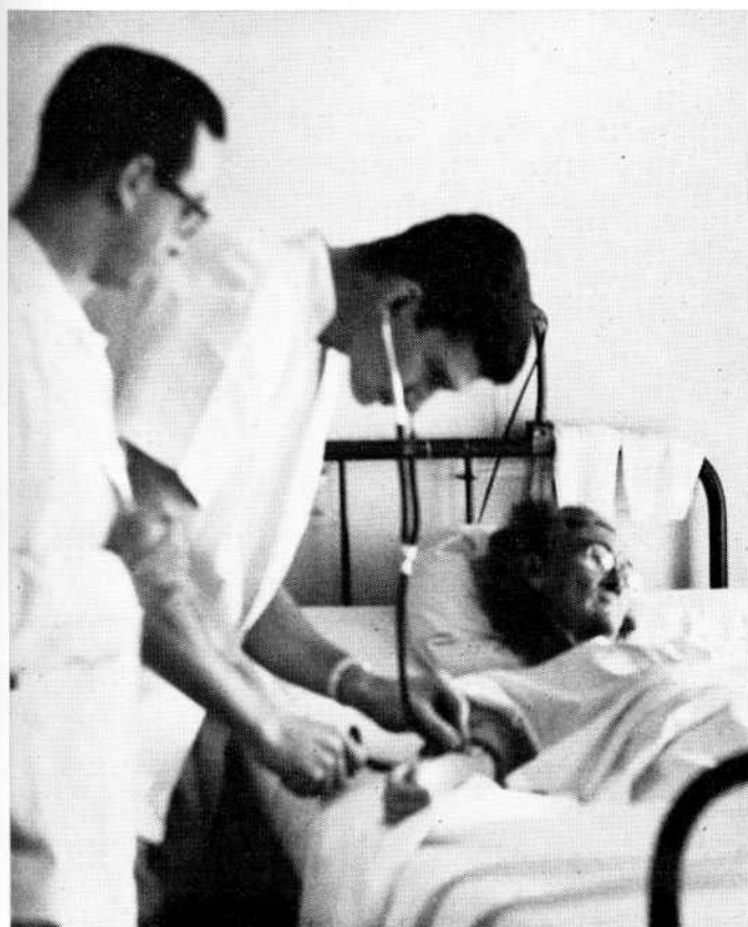
As a part of his clerkship in medicine, third-year student gives bedside care under observation of resident physician. Third and fourth year students are called "Doctor" by staff.