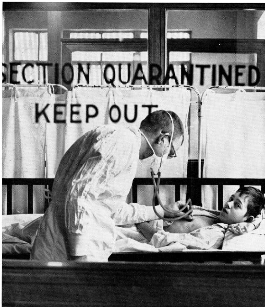
Junior students work with patients in University Hospitals to learn the practical applications of laboratory and lecture room. All work is carefully supervised by doctors.