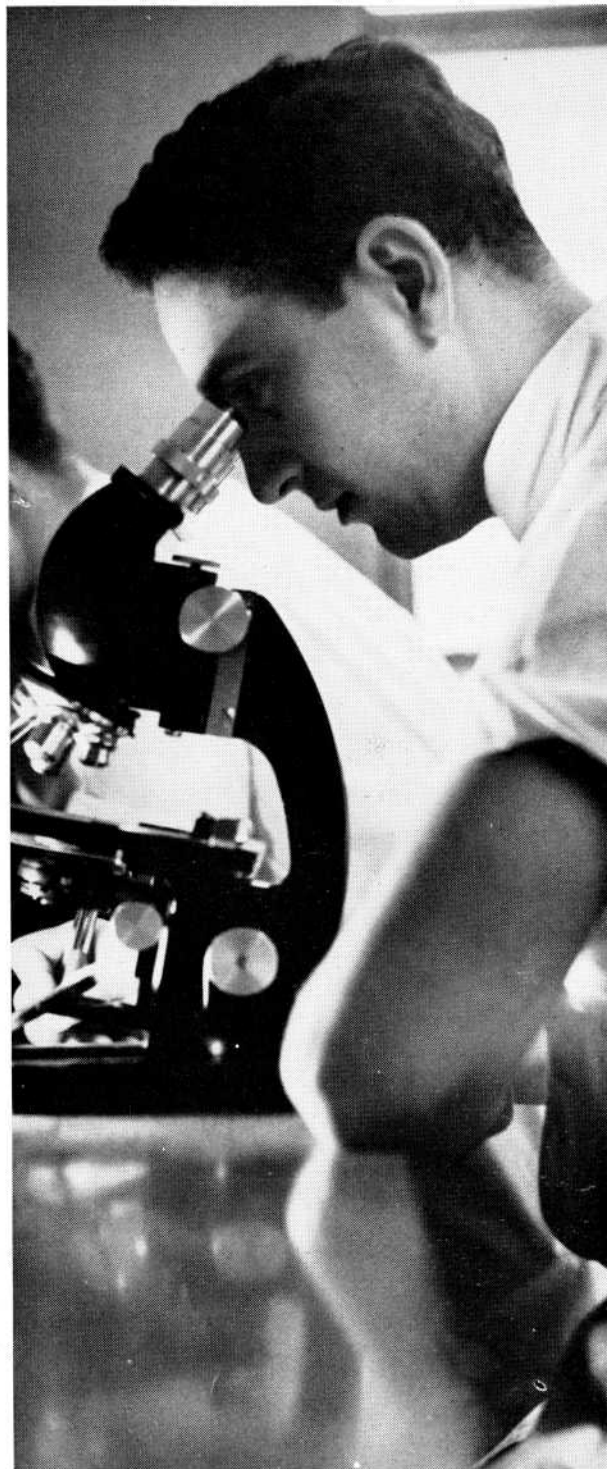
Junior students do routine and emergency clinical work for patients especially assigned to them. Much more elaborate setup handles the large majority of laboratory examinations.