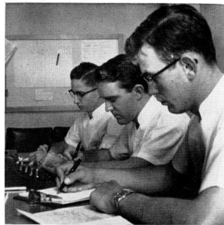
Three junior students write up case histories.