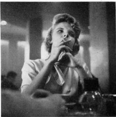
The rest is over. Tomorrow brings more tests. Time to start next study session.