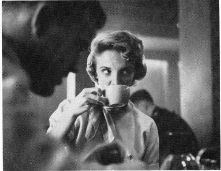
The quick ecstasy of relief begins to subside and fatigue takes over. Eyes veiled by hours of concentration look tiredly at the noisy Union clientele.