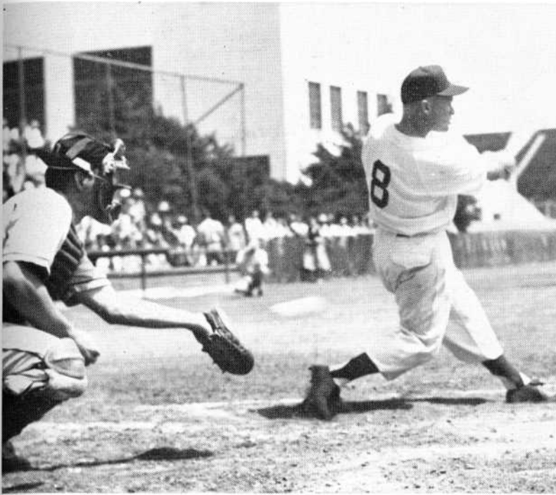
In baseball, it was O.U. vs. the Aggies in a high-scoring game. The Sooners turned back the Aggies 11-9. O.U. soccer team also defeated the Aggies in closer contest, 3-2.