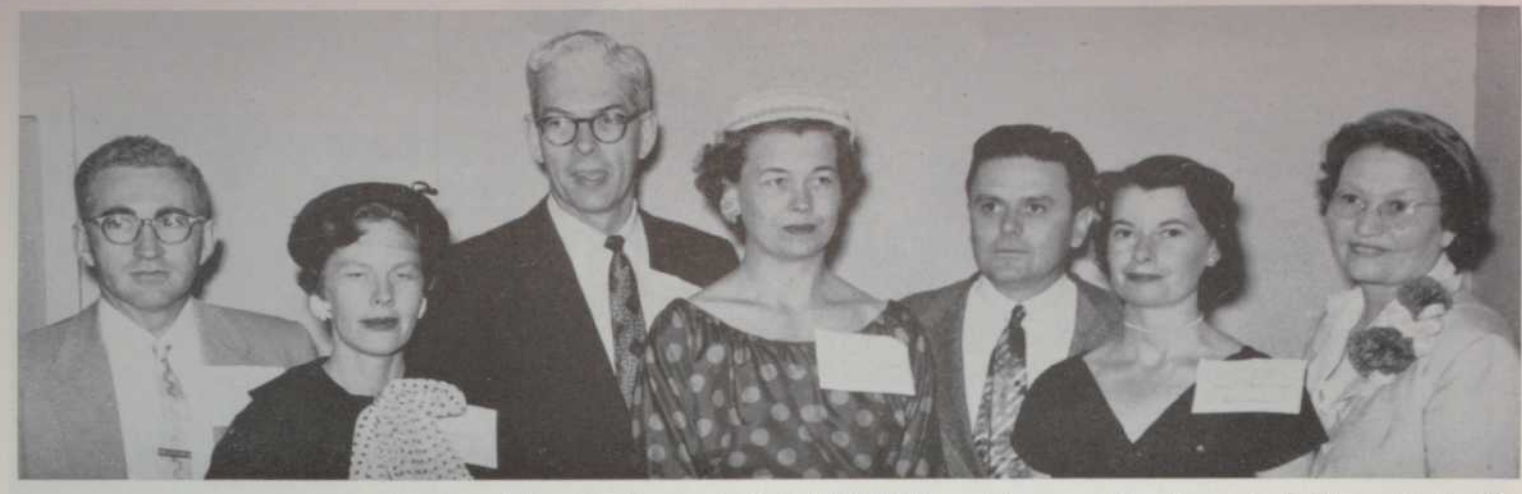
CLASS OF 1941