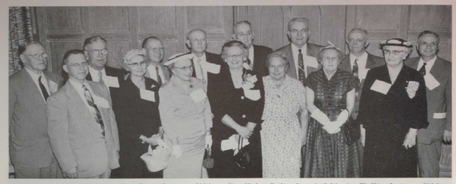
CLASS OF 1911