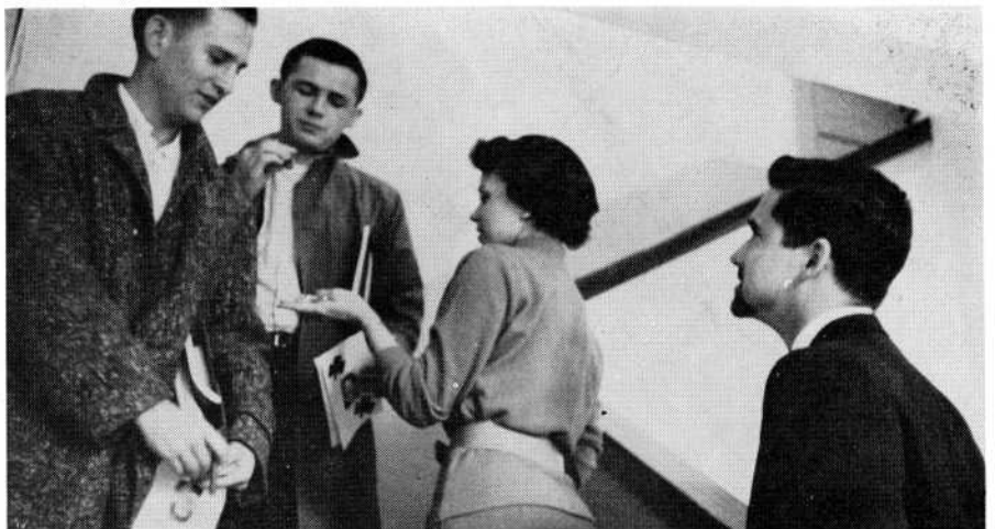
The manager and his candidate looked for votes in the stairway of the College of Engineering.