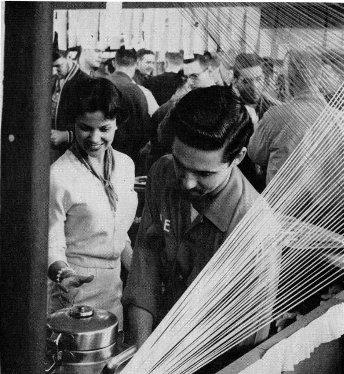
Winning queen with her campaign manager pours coffee and passes out cookies on day of election in final bid for votes.