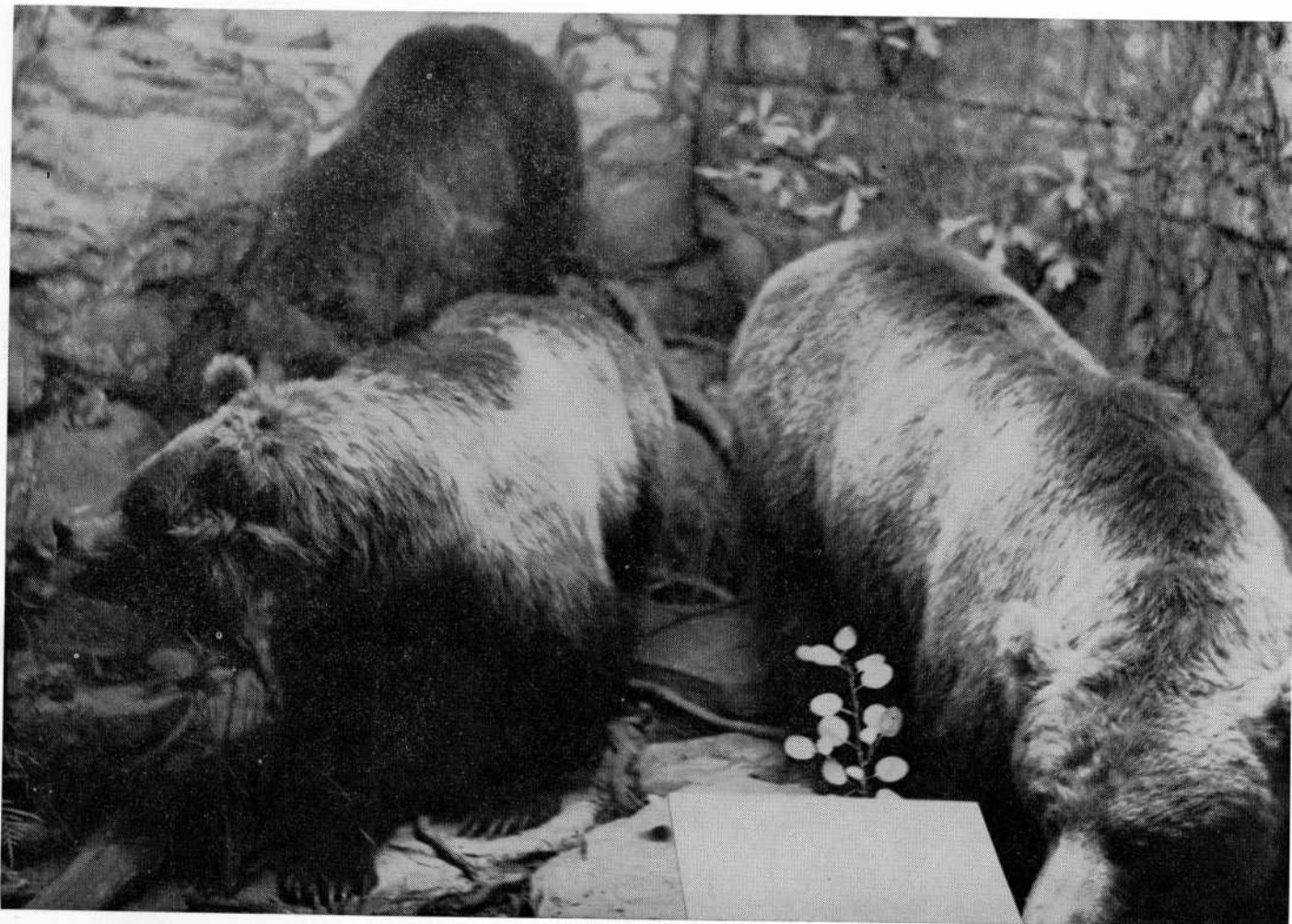
Three bears on prowl form one of the featured displays in Museum's showroom devoted to birds and mammals. Authentic surroundings add to exhibit.