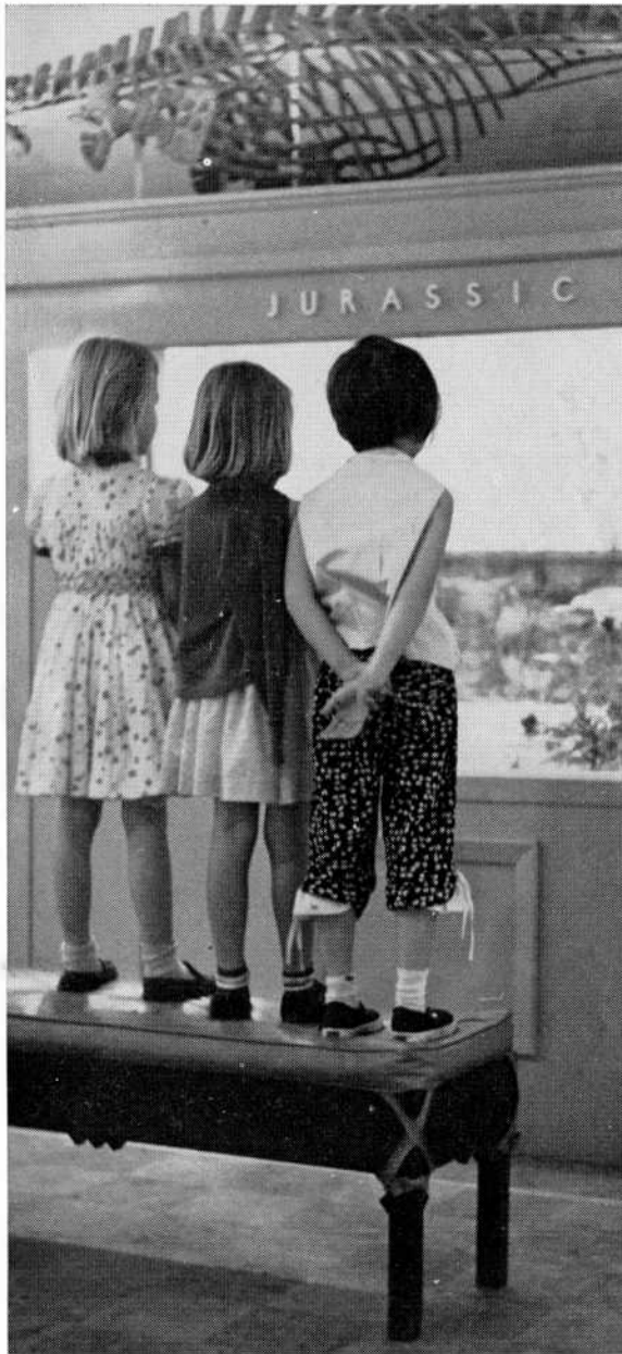
Three little girls study exhibit as their mother, out of picture, reads explanation of what they are seeing in Geology Division.