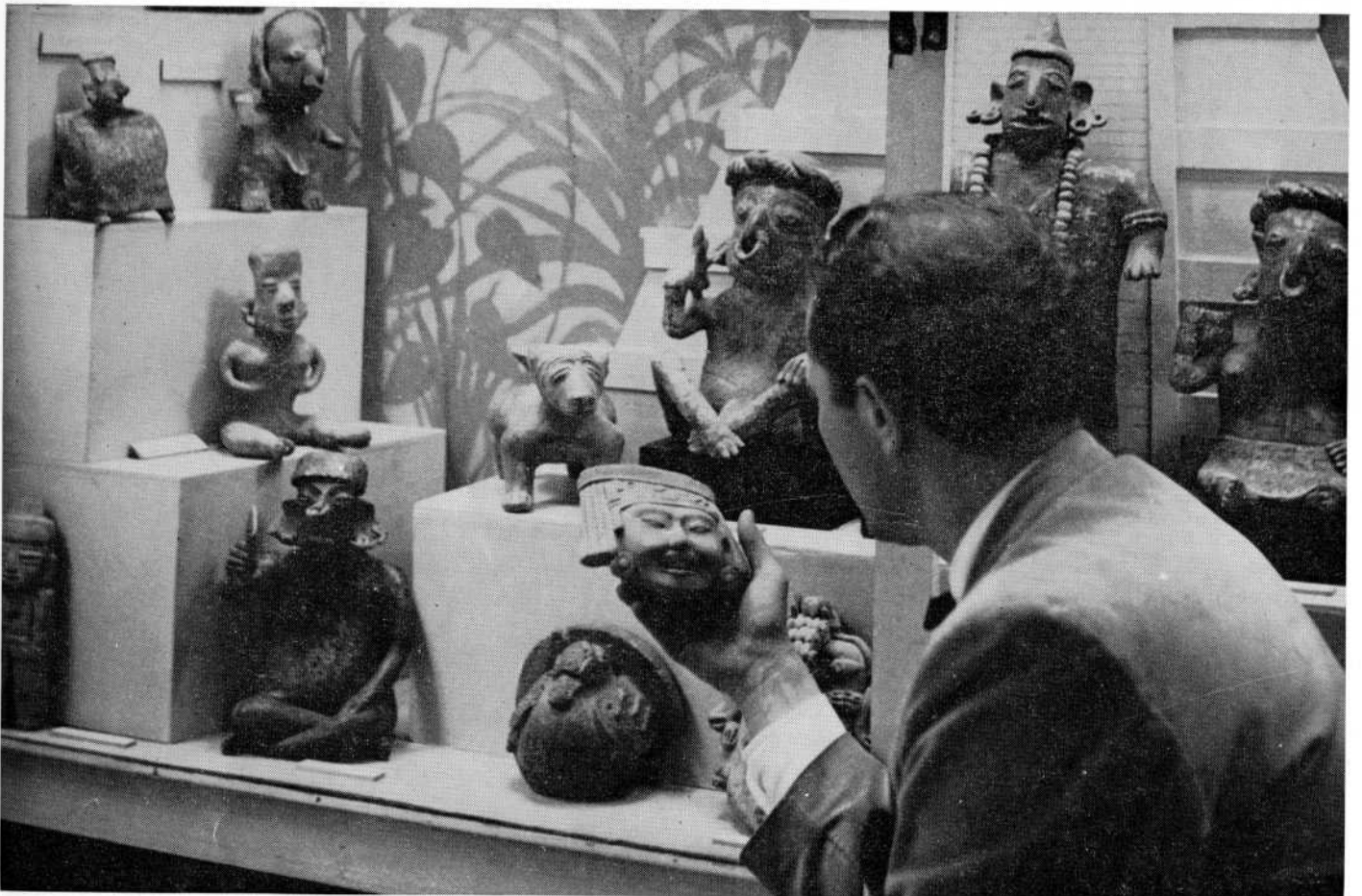
The Museum recently purchased valuable pre-Columbian art collection as result of gift from Alumni Development Fund. Part of collection is pictured.