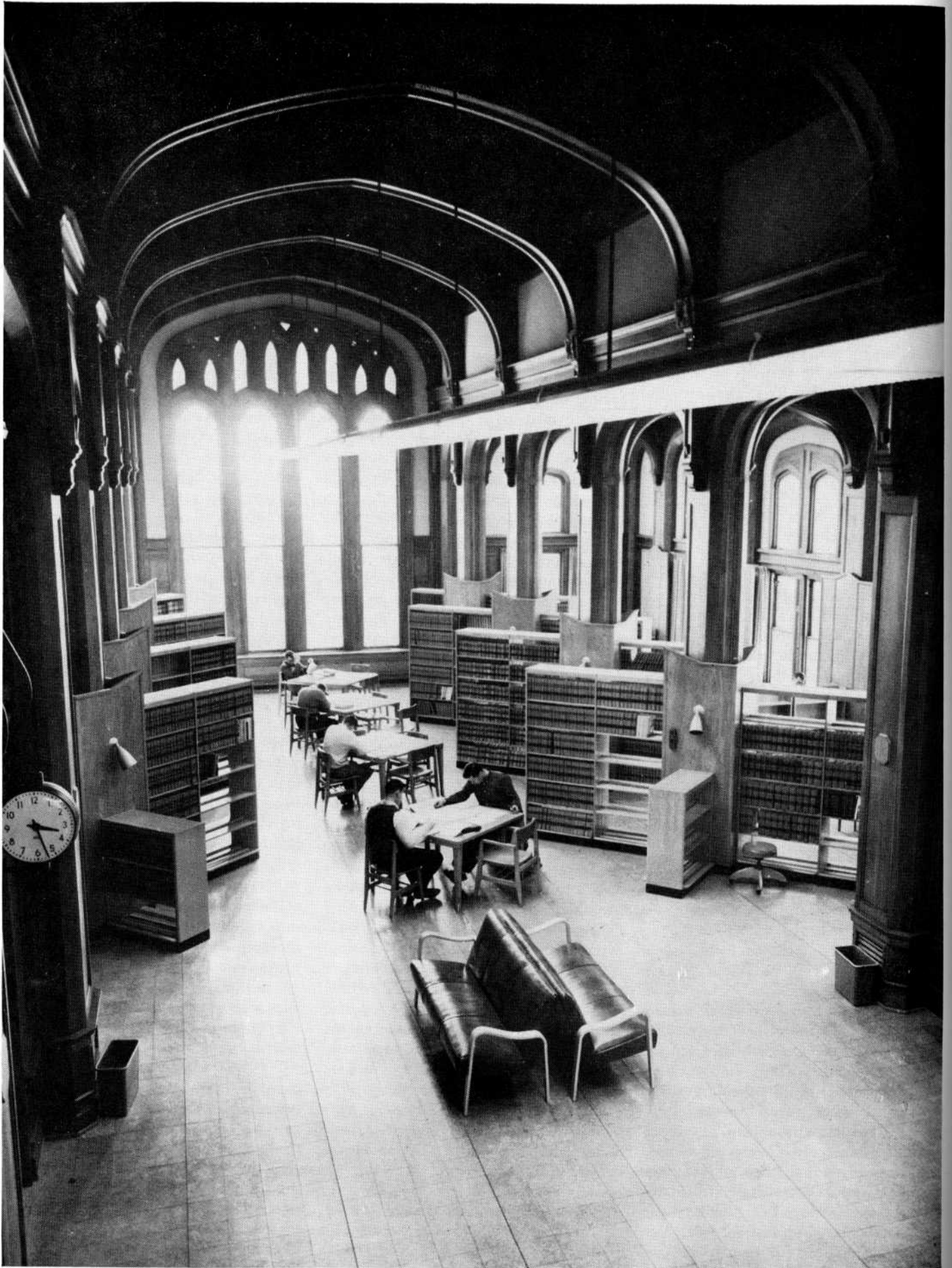
The University's Law Library, remodeled about three years ago, was best helped by better lighting. Students used to joke about dark interior.