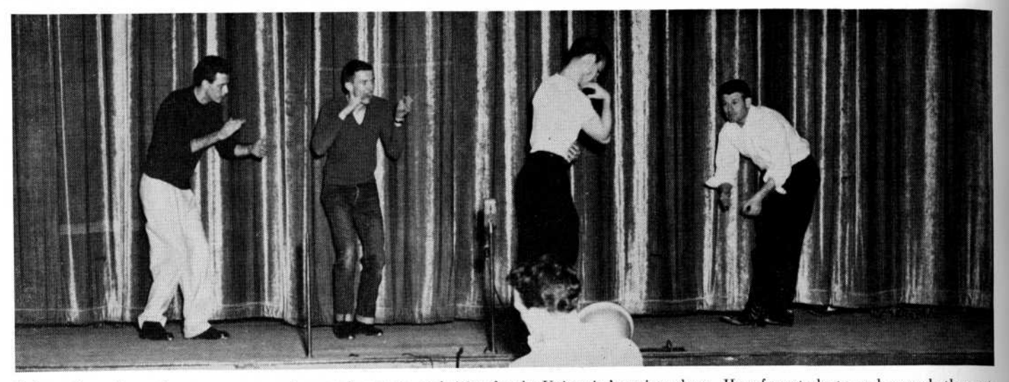
Rehearsals are long-in some cases spanning nearly a year-and tiring for the University's variety show. Here four students work over rhythm act.

Oval, on the site of what is now the Geology Building. It featured a ferris wheel and a merry-go-round as well as fund-raising booths built and manned by sororities, fraternities and other organized houses.