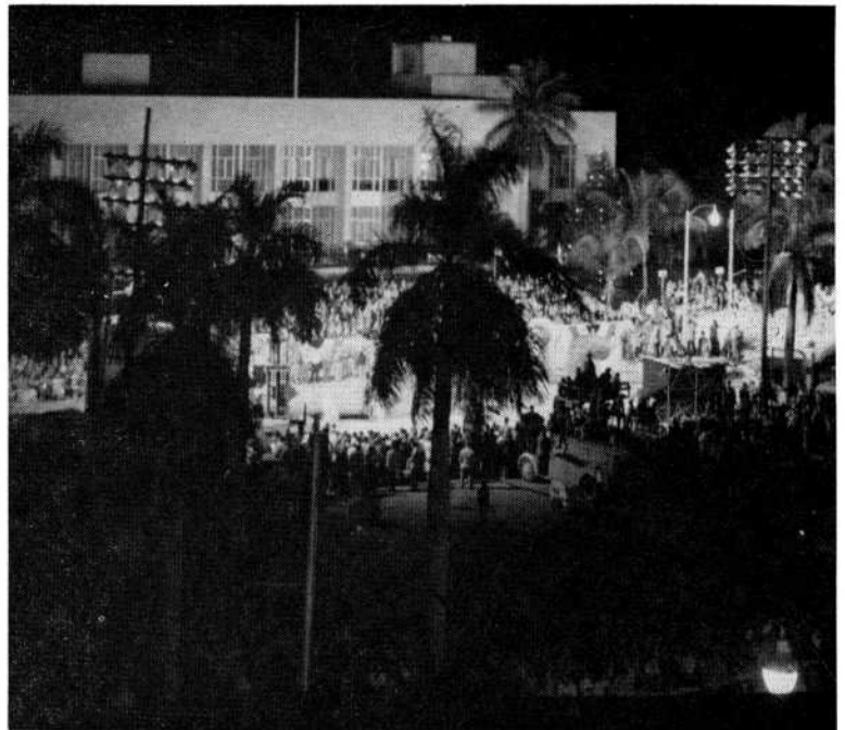
From the fifth floor of a hotel, the Orange Bowl pageant's New Year's eve parade is viewed as it passes through downtown Miami. About 500,000 people lined route.