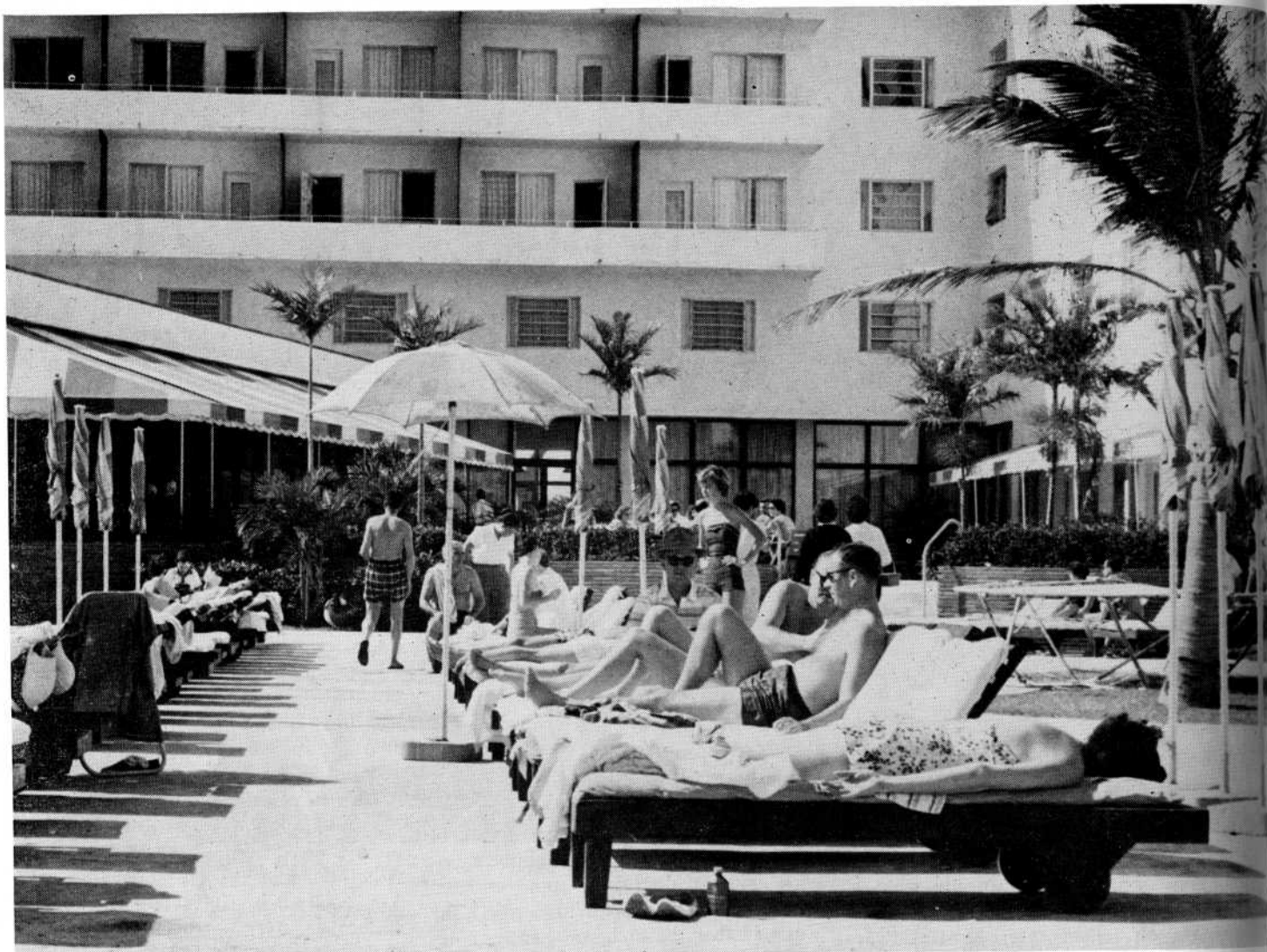
The pool area of Bal Harbor Hotel, on Miami Beach, where many Oklahomans stayed, was a real attraction. Dressing rooms rent for $1,500 per year.