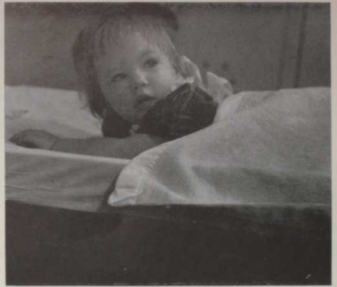
Most of them sleep on their stomachs. Ordinary noises don't easily awaken them. Here a girl is told it's time to rise and shine.