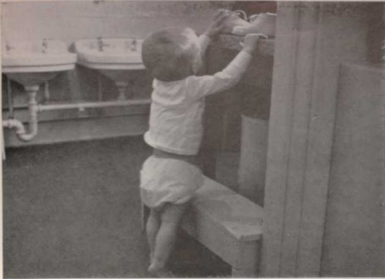
The afternoon nap is a sight to behold. Shoes removed, this boy and approximately 180 other children rest in individual, steel-frame beds in many rooms.