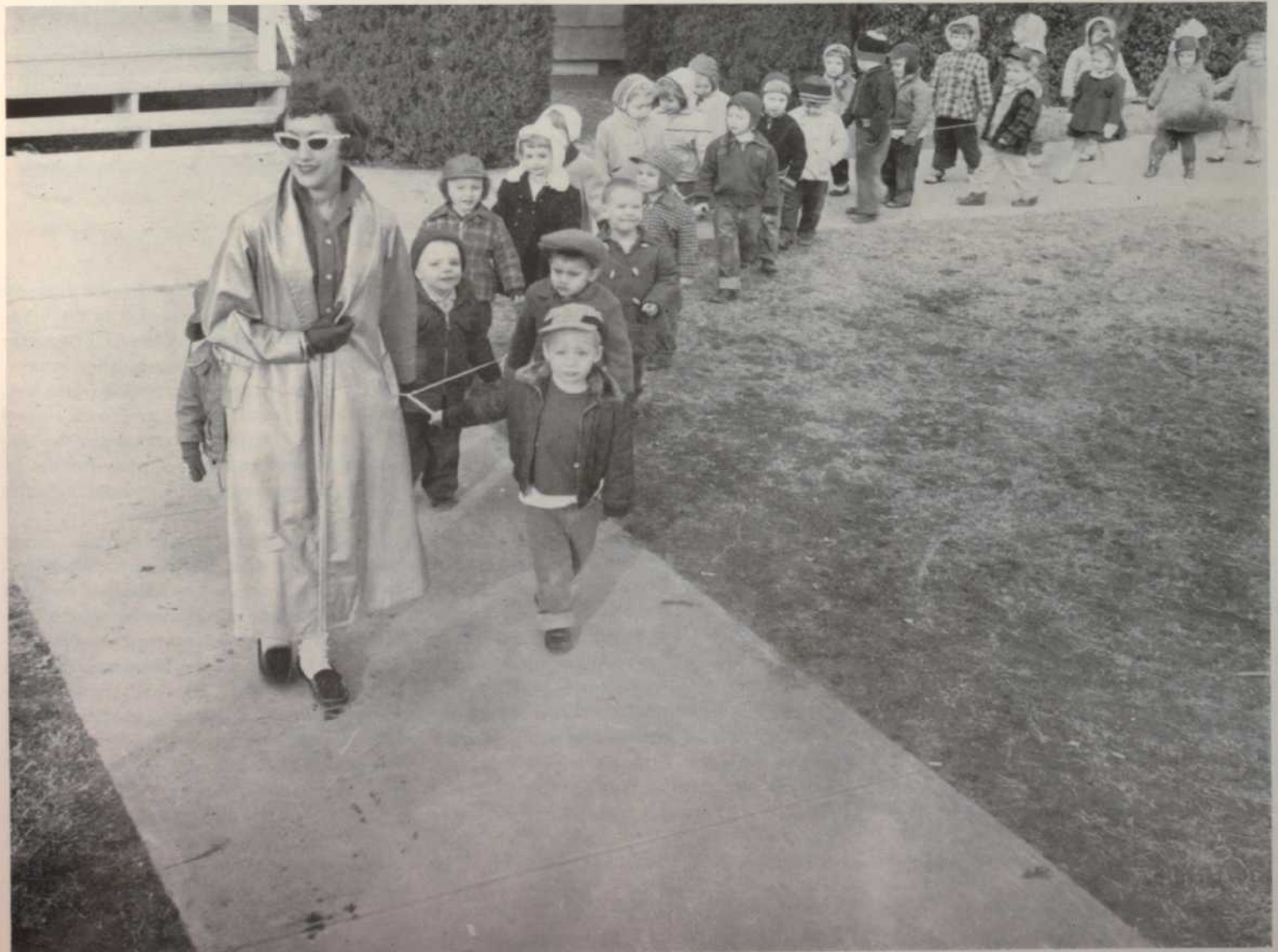
Exploring the campus, a group is led by an instructor holding a rope. The children are told to hold onto the rope at all times, and they usually do.