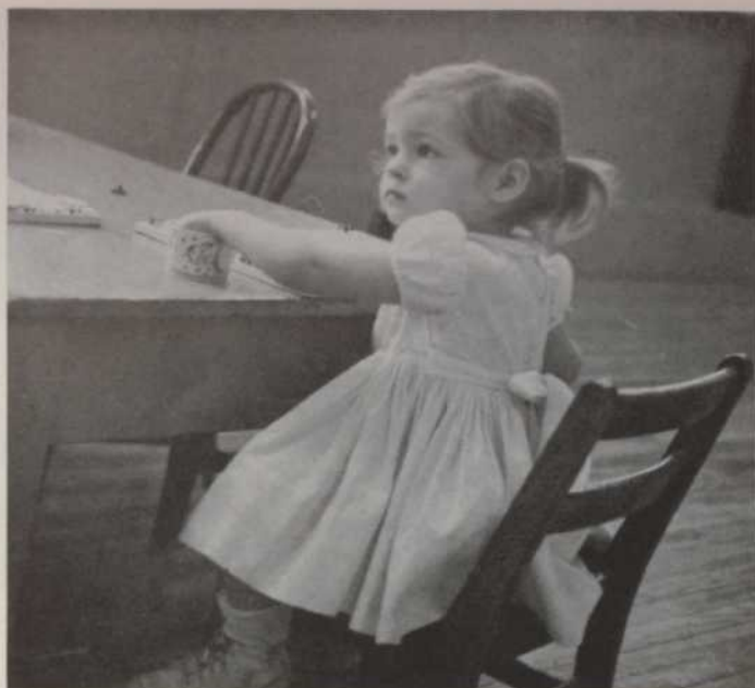
Most of the Nursery and Kindergarten games are constructive, teach the children to follow instructions, also to think for themselves.