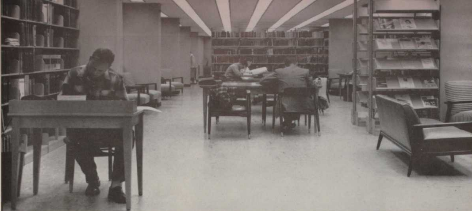
In this particular area students can relax in just about any manner except lying on the floor. Books, magazines surround each of the many such areas.