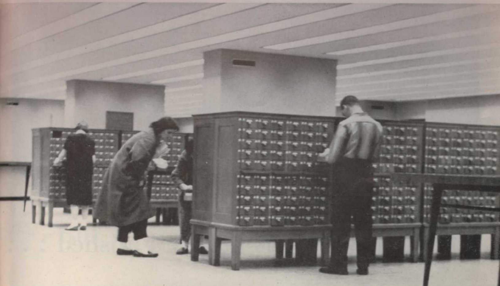
A massive card catalog, only part of which is shown here, is located on the annex's ground floor, serves as key and guide to any desired title.