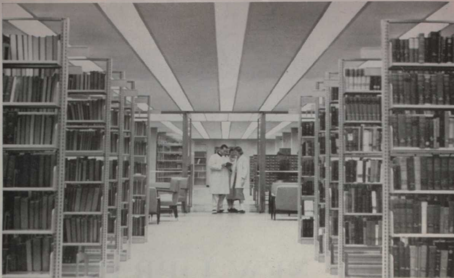
The new library addition suddenly makes "open" stack system workable. This floor, like four others, puts thousands of books at one's fingertips.

Every time you smoke a cigarette, you will be helping to pay for the newest and most modern structure upon the campus.