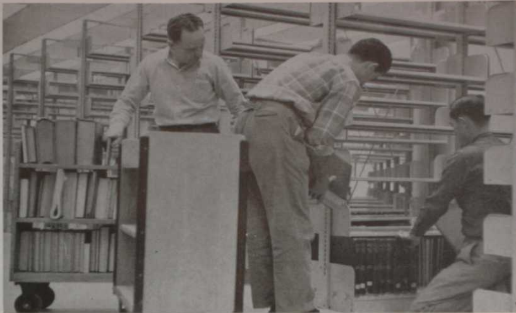
Student employees cart tons of books from old "closed" stacks and branch units to new steel shelves.