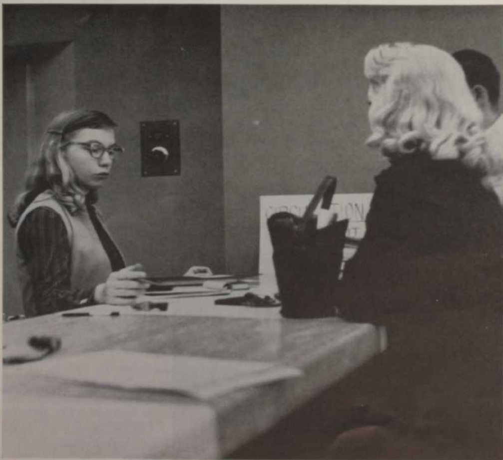
First days of occupancy were a nightmare of questions and answers. Woman at left, a regular employee of the library, not only checked out books at circulation desk but also "directed traffic."