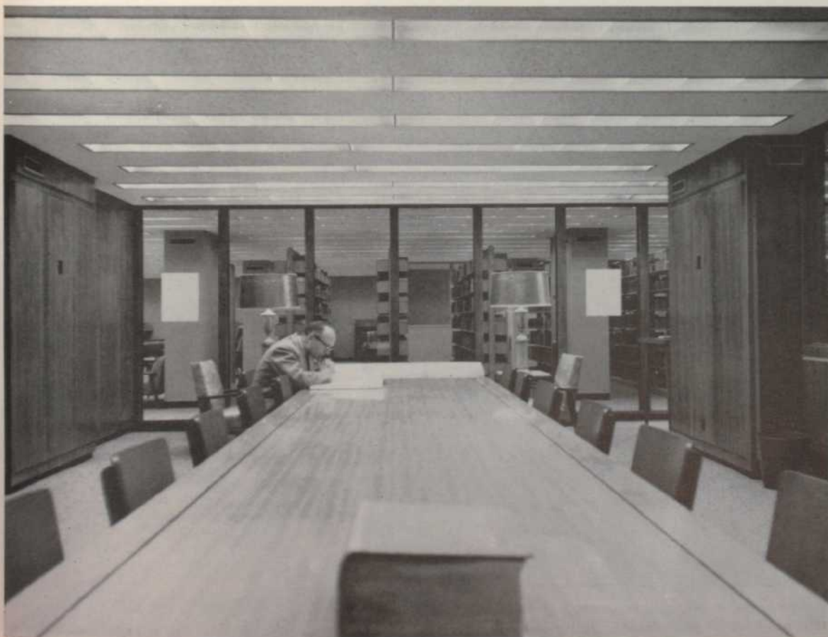
A teacher studies in solid comfort in a room designed to meet such faculty needs. Object in foreground: a giant dictionary.