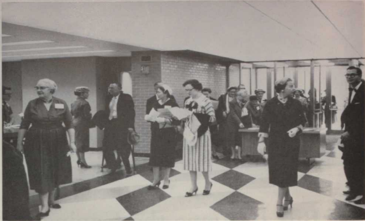
Dedication of new library April 11 drew an overflow crowd. Following ceremony, reception was held in new annex (above).